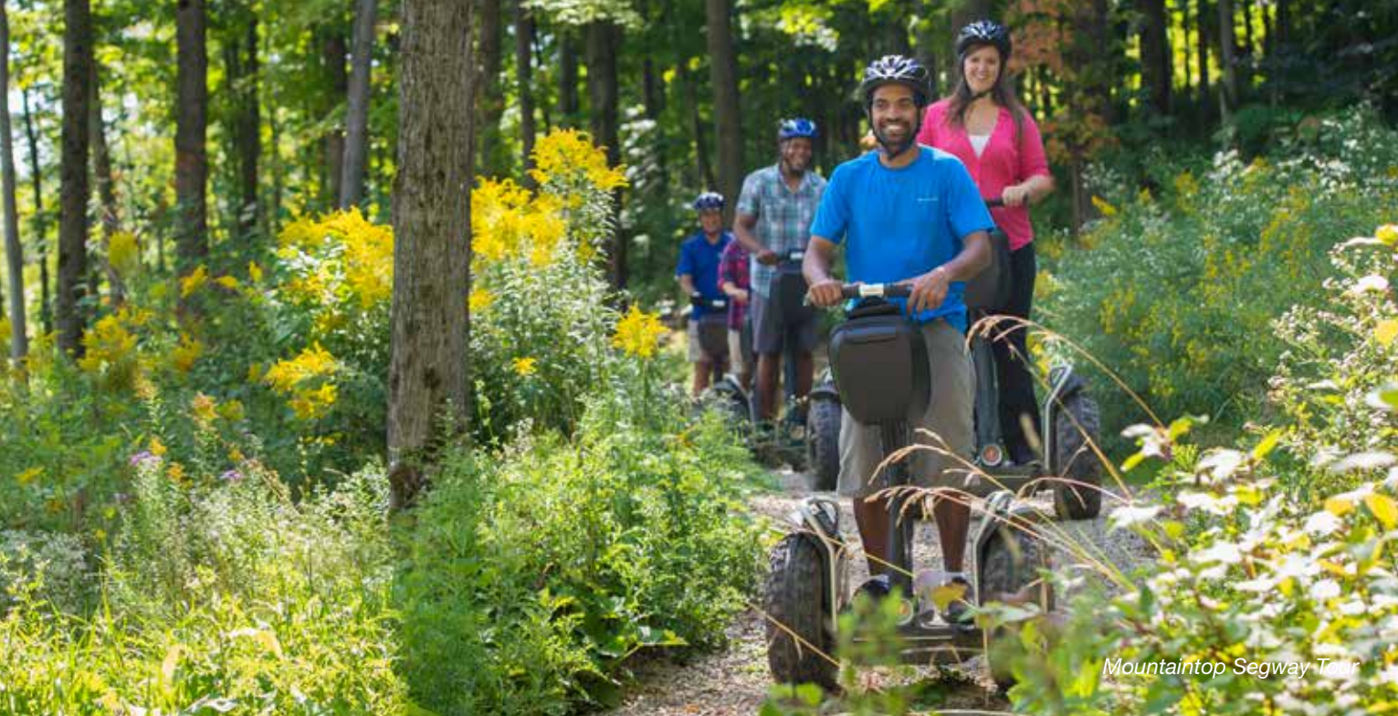
Mountaintop Segway Tour