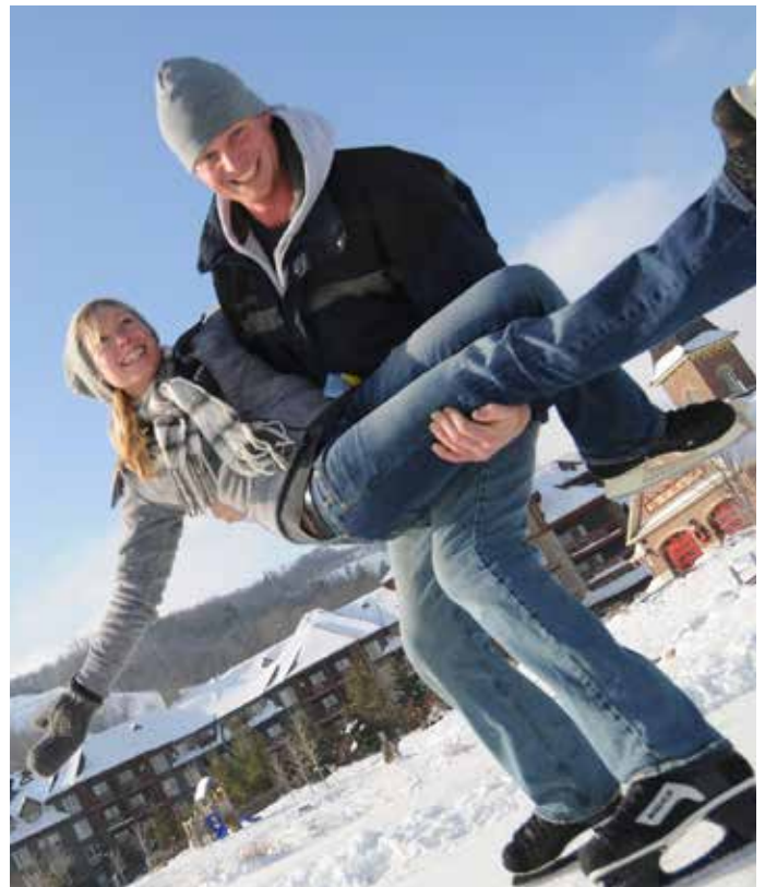
Top: Ski and Snowboard Lessons Right: Skating on the Mill Pond