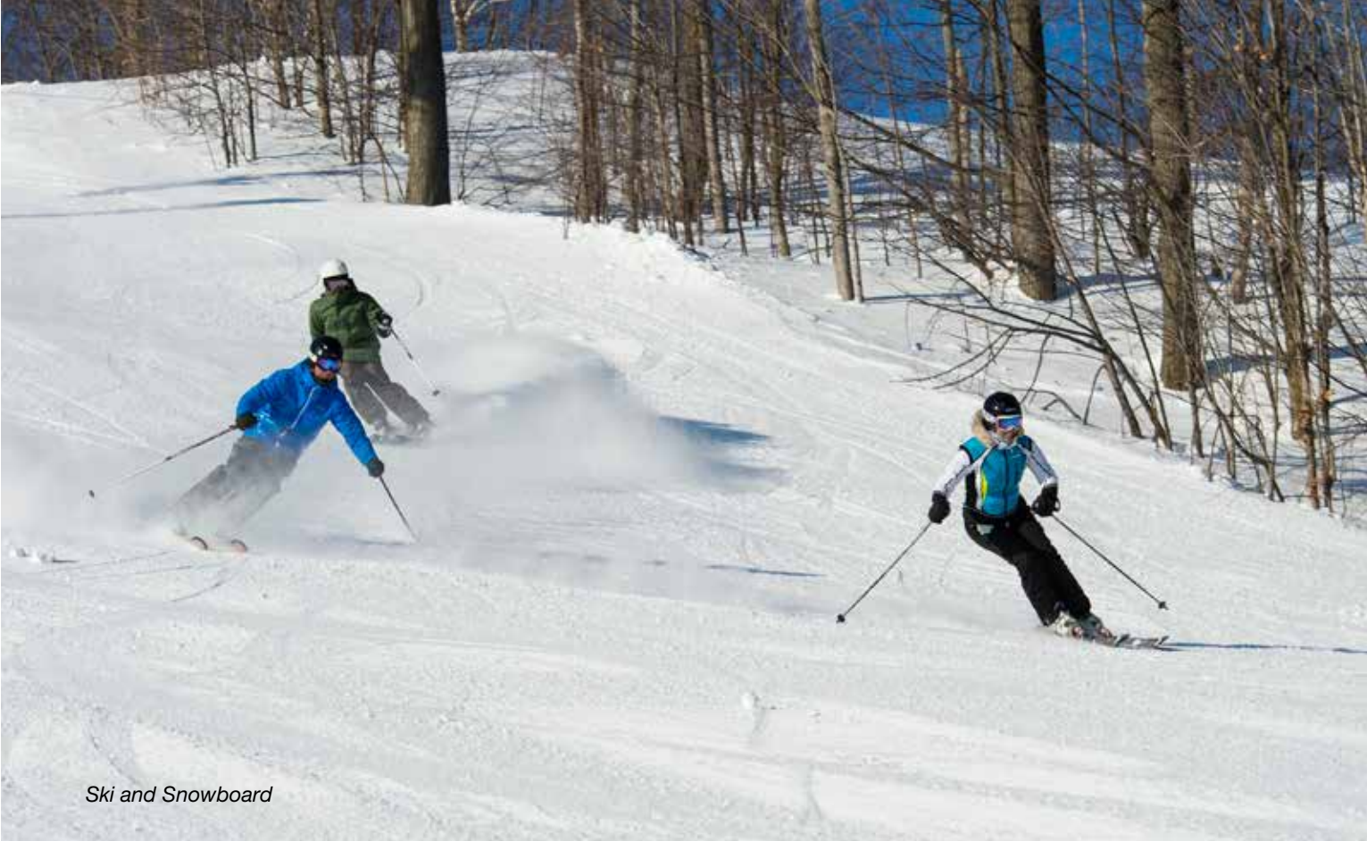
Ski and Snowboard