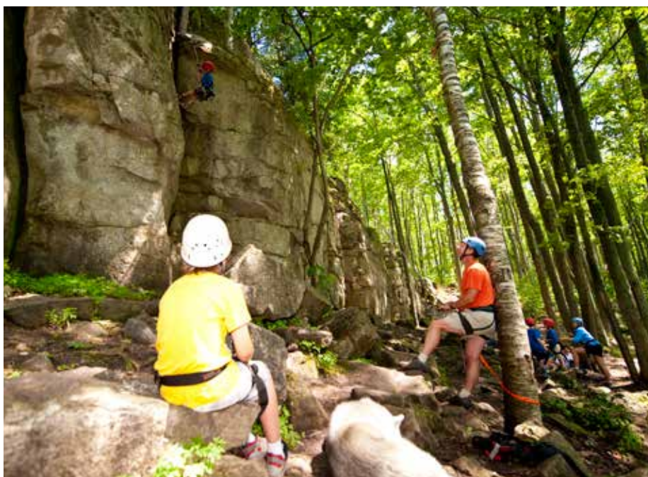
Top: Brewery Tour Right: Rock Climbing