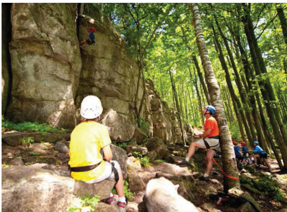
Top: Brewery Tour Right: Rock Climbing