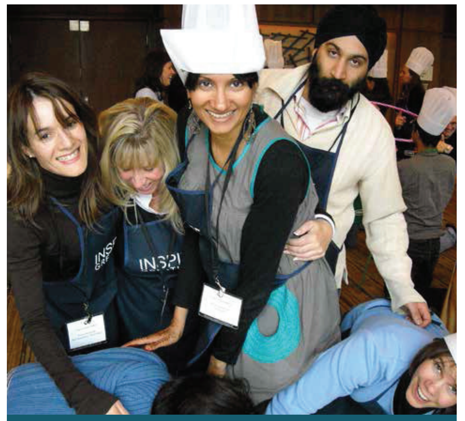
At Summit, our team building programs are designed to create an experience that resonates. Infuse your event with positive energy by integrating a unique team building option into your agenda. These one-of-a-kind experiences take full advantage of the unique settings at Blue Mountain Resort. Your Summit Team Building program will foster effective relationships, elevate morale, and make your Blue Mountain experience unforgettable!